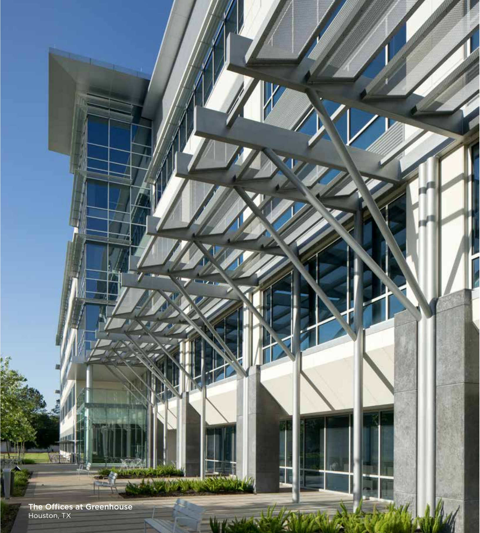
The Offices at Greenhouse Houston, TX