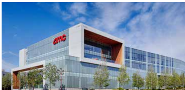
Park Place Village, Leawood, KS Mixed Use