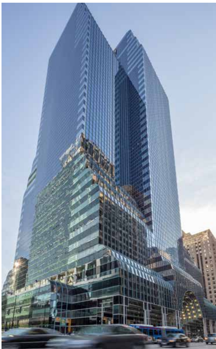
500 W Madison, Chicago, IL Office