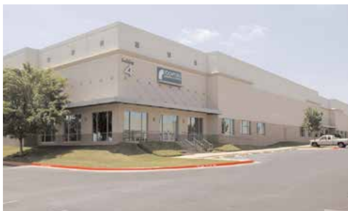
South Park Commerce, Austin, TX Industrial