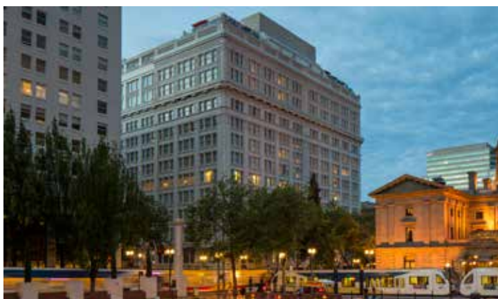
Meier & Frank Building, Portland, OR Office Redevelopment