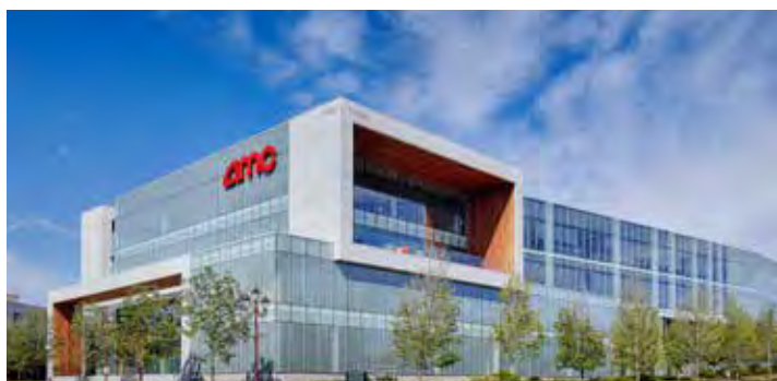
Park Place Village, Leawood, KS Mixed Use