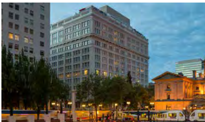
Meier & Frank Building, Portland, OR Office Redevelopment