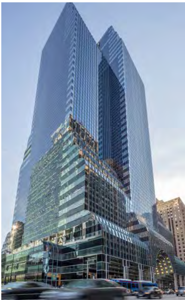
500 W Madison, Chicago, IL Office