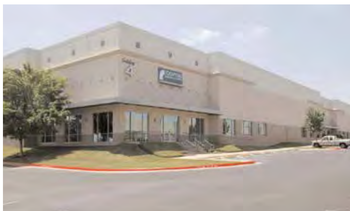
South Park Commerce, Austin, TX Industrial