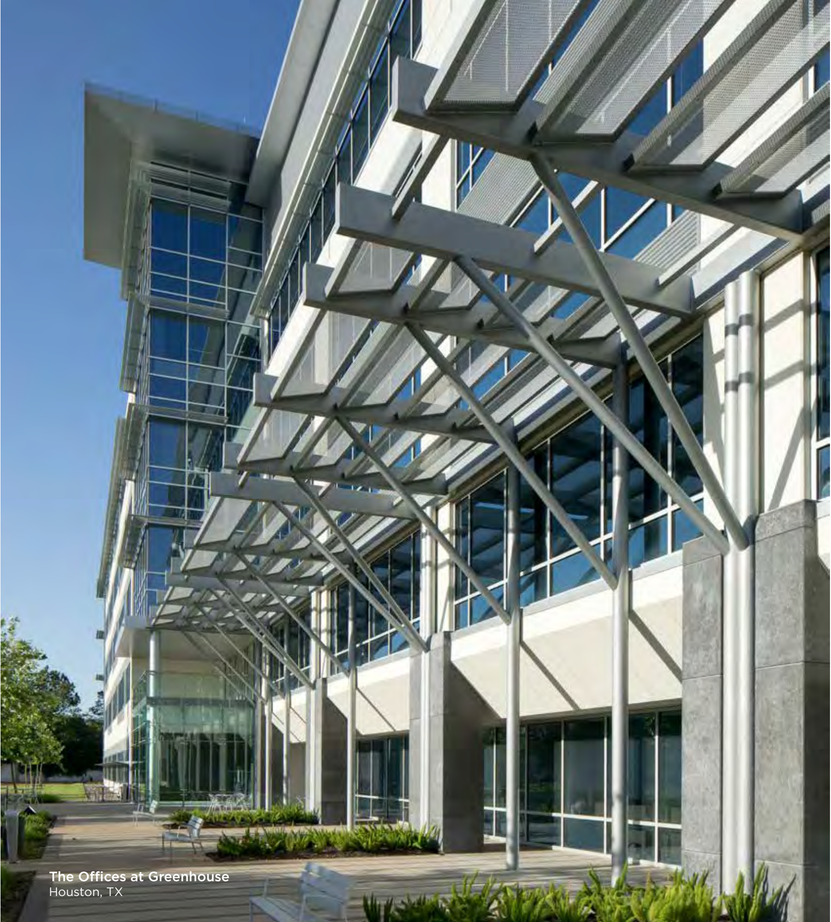
The Offices at Greenhouse Houston, TX