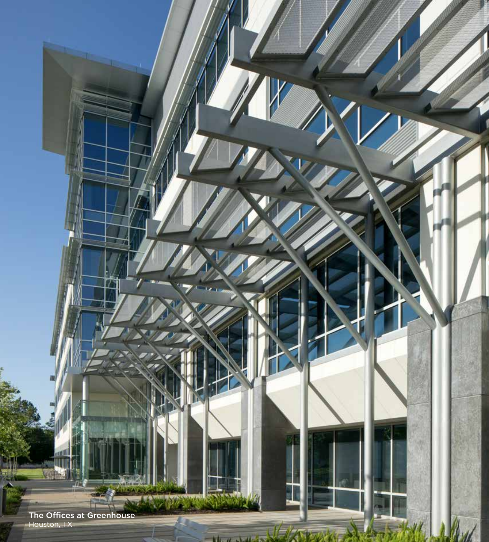
The Offices at Greenhouse Houston, TX